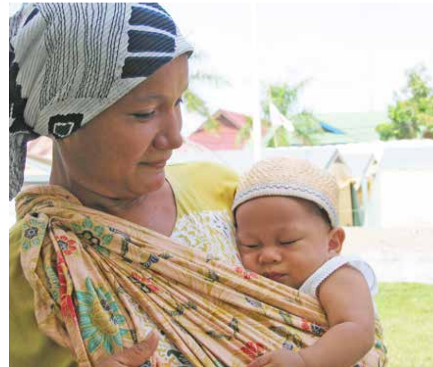
Your support helps moms living in poverty zones have healthy babies who are the joy of their lives.