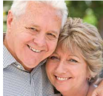
What will your legacy be? Here's how you can start building it today with Project HOPE.

You can help shape Project HOPE's future by including Project HOPE in your estate plans. When you include Project HOPE in your will, it doesn't affect your current cash flow or assets, and it's simple to revise if your circumstances change. Best of all, you have the satisfaction of knowing that your legacy will be one of hope for others.